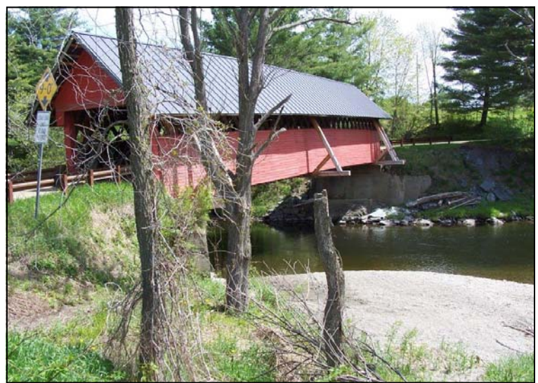
Dianne Laplante's photo of the Missisquoi River

walk outside, slide my canoe over the bank and paddle off with a hot coffee and camera in tow; very early and very quietly exploring all the little inlets and quiet areas, perhaps managing a few photos of wild things from the River's perspective. Canada geese sounds sometime emerge from hidden nests as you float by. Paddling can be done most of the year, which makes for interesting canoeing and picture taking. As I paddle on quiet mornings I'd appreciate the little areas of challenge with a few rapids to maneuver my way around upstream or down and practice my skills at the stern. On the flats, I could really work on a bit of exercise paddling against the current. It feels so good to have this experience using your shoulders and arms, just you and the boat.