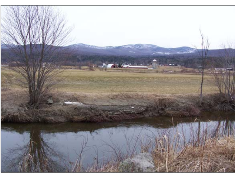
Dianne Laplante's photo of the Missisquoi River

As I wander, I am constantly amazed at the natural beauty of the river and how it melts into the natural landscape of farms, woodlands, wild areas, and backyards of ordinary folk who, like me, get to enjoy its beauty year round. I always think how cool it would be to live by the river and just get up in the morning,