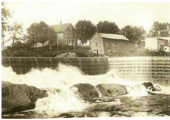
Photo of the wooden dam