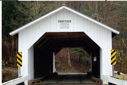
Comstock Bridge, Montgomery, VT.

The Study Committee meetings are well underway, and our current mission is identifying what outstandingly remarkable values (ORVs) exist in and around the upper Missisquoi and Trout Rivers, and what their state and national significance may be. Help us celebrate these rivers by letting us know what YOU feel are the outstanding resources of the Upper Missisquoi and Trout Rivers. What areas of these rivers provide —>