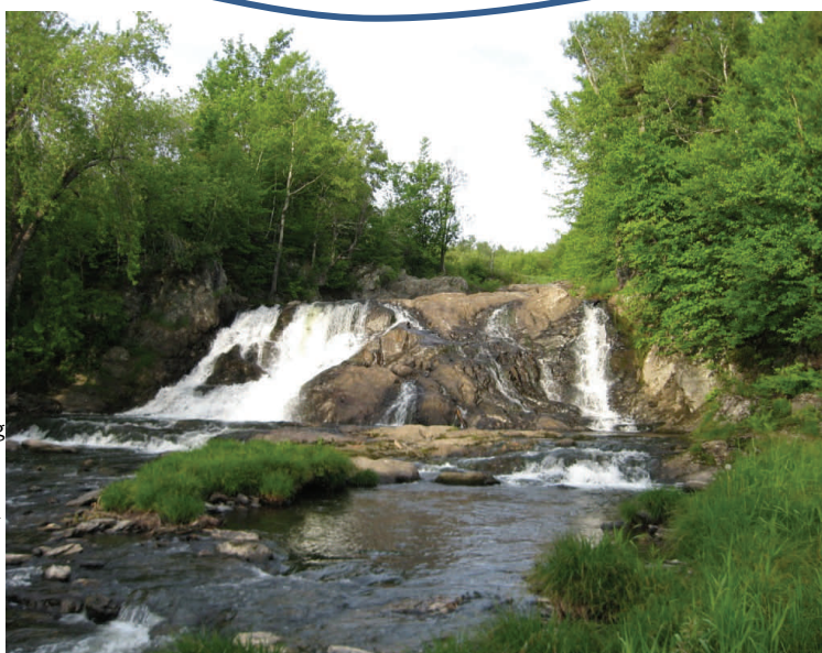
Baker's Falls, Missisquoi River.